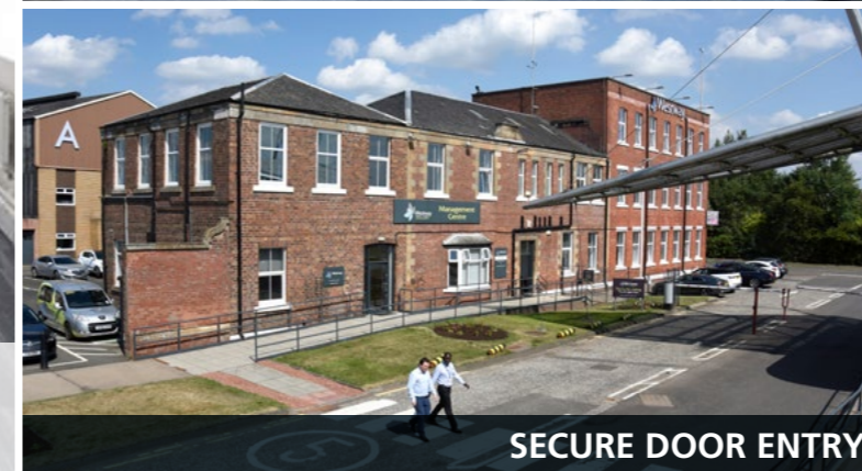
SECURE DOOR ENTRY